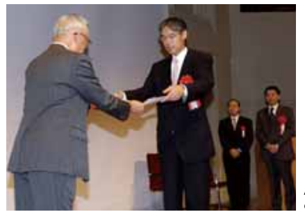
Award ceremony at the debriefing session

* This activity is part of a Ministry of Health, Labour and Welfare campaign started in 2005 to create communities knowledgeable about dementia.