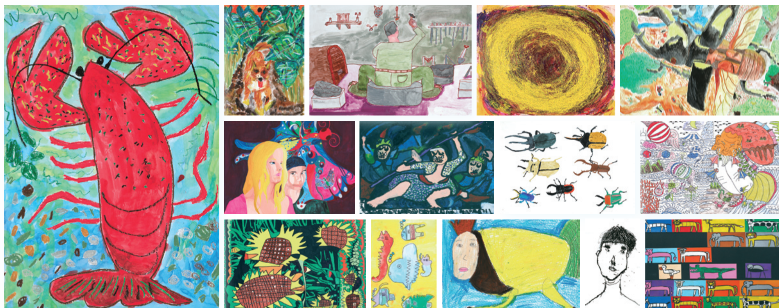
The works of art shown on the front and back covers were among those which received awards for excellence in fiscal 2006 at the fifth annual art contest held by Mitsubishi Estate for children with disabilities.